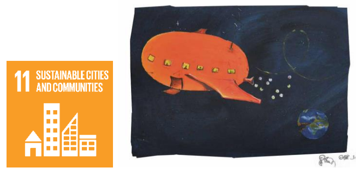
A child asks: "Will we be living in spaceships because the earth is sick?"