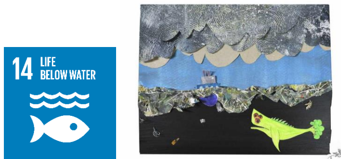
A child asks: "What happens to all of our trash?"