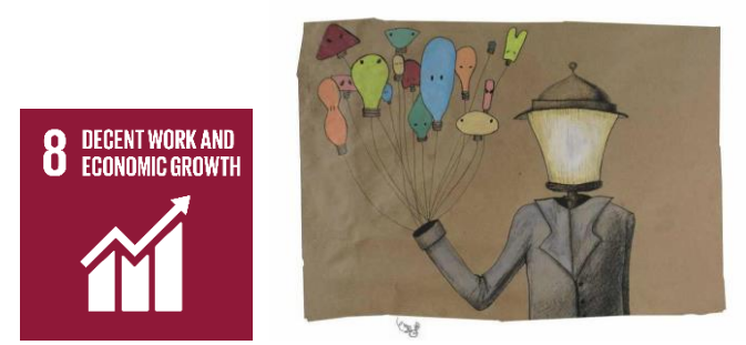
A child asks: "Where exactly can we find the soul in our body?"

(in german / other edition for young adults: Kamkwamba, William: Der Junge, der den Wind einfing, 2012)