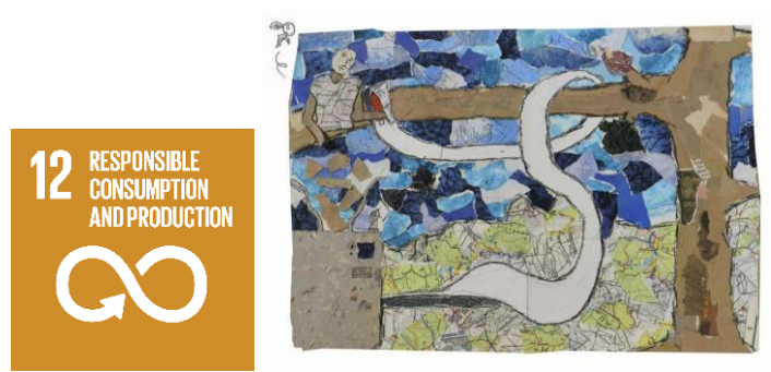
A child asks: "Can we still draw if forests are being destroyed to make paper?"

(in german: Brown, Peter: Der neugierige Garten. Zürich, 2014 / ab 4 Jahre)