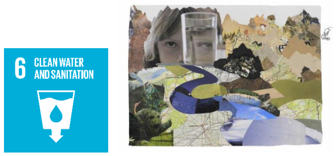
A child asks: "What happens when the water is gone?"

(in german: Nivola, Claire A.: Das blaue Herz des Planeten. Stuttgart, 2015)