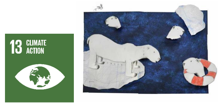
A child asks: "Why is there so little snow?"